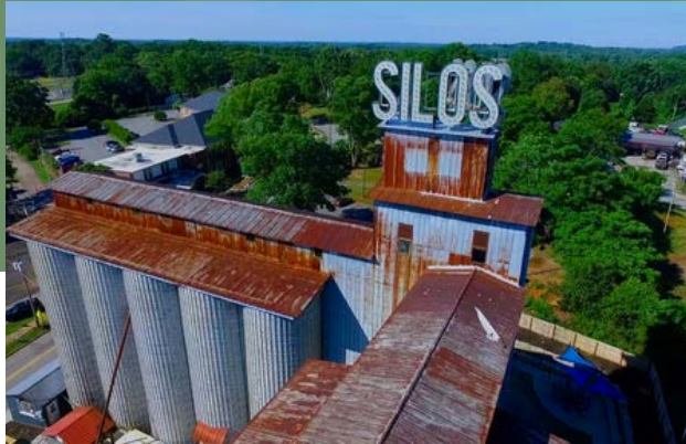
THE SILOS IN EASLEY